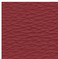
5003 red star